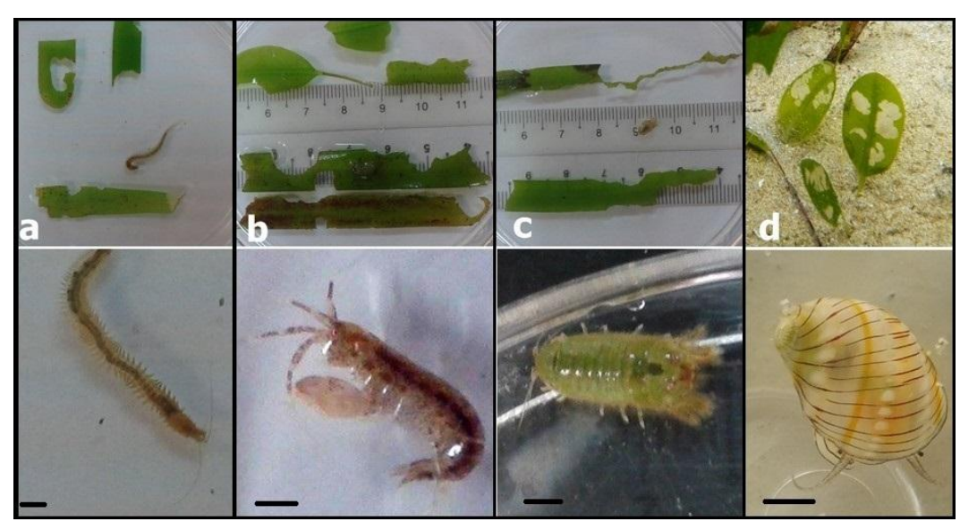
Figure 2. Species-specific bite marks by mesograzers in husbandry tanks. (a) Irregular serrated by polychaete, (b) random circular bite marks by amphipod, (3) leaves almost devoured by isopod and (d) transparent leaves by nerite snail.

Bite marks on the seagrass leaves serve as important identification key to identify mesograzer and its grazing pressure on the natural seagrass meadows. Although there were no direct observations of the grazing activities but isolation of these associated marine fauna would help to determine the bite marks. Four types of bite marks were identified which are irregular serrated by polychaete (Figure 2a), random circular by amphipod (Figure 2b), leaf almost devoured by isopod (Figure 2c) and plant sap sucked by nerites snails that created transparent cell wall structure on seagrass leaves (Figure 4d). Nevertheless, these findings will help in identifying the grazing impacts on natural seagrass meadows.