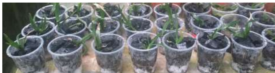
Figure 2. Acclimatized plantlets after two months in the glass house.

The in vitro well-developed rooted plantlets of D. lowii were successfully hardened on potting mixture containing coco peat and sphagnum moss (2:1). After 2 months, 78% of plants survived after transferred to the glasshouse (Figure 2). This work suggests that these mixtures are favorable for the acclimatization of epiphytic orchids. This simple and efficient procedure for regenerating a large number of plantlets from shoot tip cultures could be used for large-scale propagation and ex situ conservation of this endangered species.